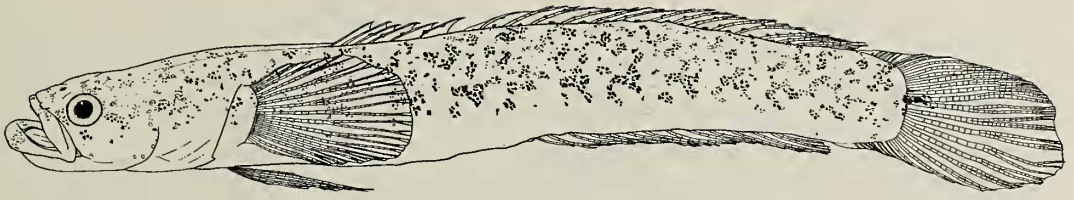
Fig. 1. Right lateral view (reversed) of Xenisthmus balius , holotype, BPBM 30458, 25.5 mm SL female, Jana I., Saudi Arabia, Persian Gulf; scales omitted.

length 569 (534–571); first dorsal-fin origin to second dorsal-fin origin 188 (183–207); second dorsal-fin base length 361 (328–375); anal-fin base length 271 (284–309); pectoral-fin base depth 71 (68–79); first dorsal-fin origin to pelvic-fin origin 165 (159–178); second dorsal-fin origin to anal-fin origin 133 (129–156); snout length 35 (38–44); orbit diameter 47 (44–61); head width 133 (129–148); body width 118 (117–148); bony interorbital width 20 (19–24); snout tip to retroarticular tip 98 (91–99); caudal peduncle length 149 (147–171); caudal peduncle depth 98 (108–119); length of first spine of first dorsal fin 78 (58–89); length of third spine of first dorsal fin 98 (72–94); length of sixth spine of first dorsal fin 67 (52–89); length of spine of second dorsal fin 78 (74–91); length of first segmented ray of second dorsal fin 94 (84–106); length of last segmented ray of second dorsal fin 110 (82–123); anal-fin spine length 55 (48–73); length of first segmented anal-fin ray 90 (71–100); length of last segmented anal-fin ray 106 (94–121); pectoral fin length 192 (158–211); pelvic-fin spine length 39 (33–53); fourth segmented pelvic-fin ray length 173 (161–192); caudal-fin length 184 (170–207).